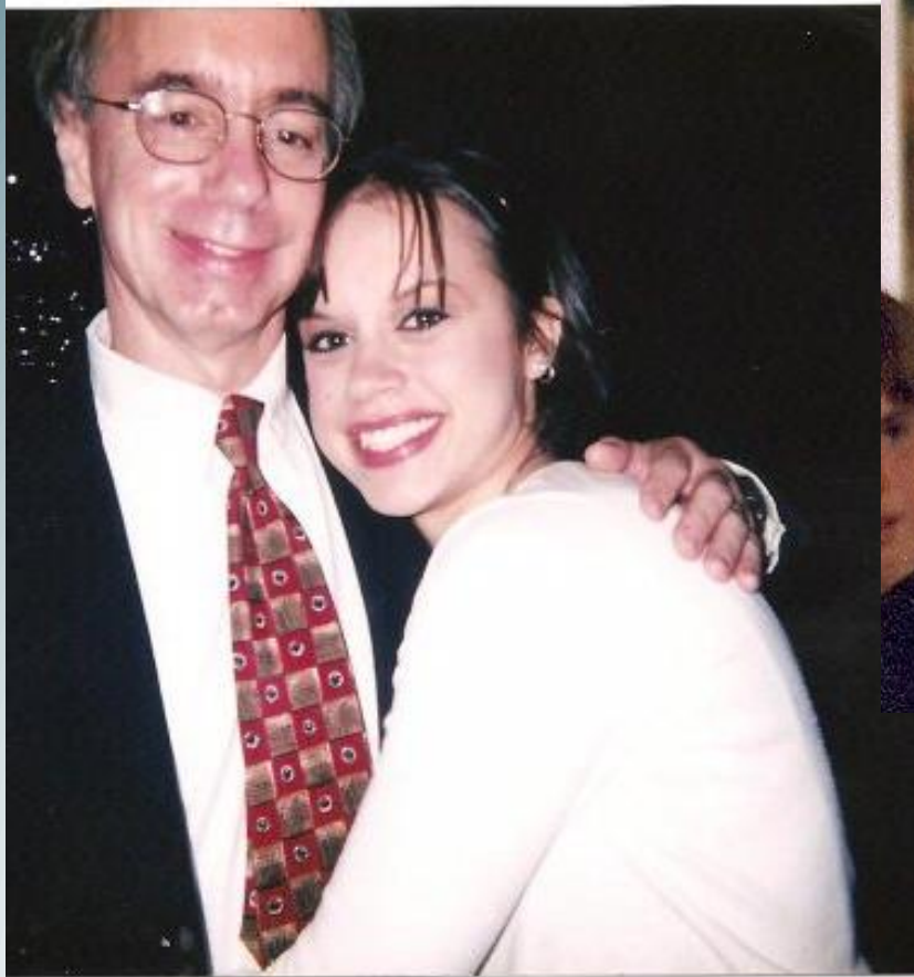
My Dad and I a couple of months after his diagnosis. He passed away 6 years later at the age of 58.